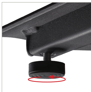
Supplied with adjustable levelling feet to accommodate uneven floor surfaces