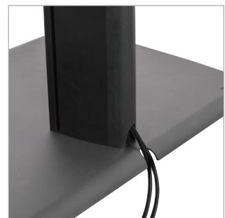
Integrated cable management for a neat and tidy installation